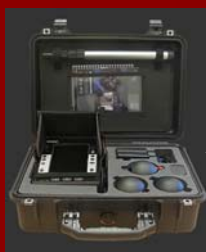
ODF Optronics Eye Ball R1