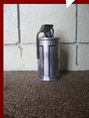
CS Gas Canister